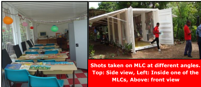
Shots taken on MLC at different angles. Top: Side view, Left: Inside one of the MLCs, Above: front view