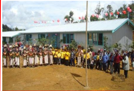
A double classroom launched on March 27th at Omai Primary School, Southern Highlands Province.

Construction is progressing, with 1 double classroom launched at the end of March in the Southern Highlands and another 2 school infrastructure projects well underway and planned for launch in April.