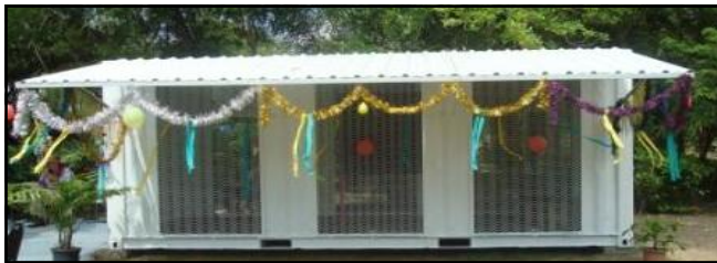
MLCs are built out of second-hand 20ft shipping containers costing about US$7, 000 per unit.

Those that have now benefited from this MLC rollout concept are settlement communities at the brinks of major towns and cities where basic services like health, education, and regular income sources are non-existent.